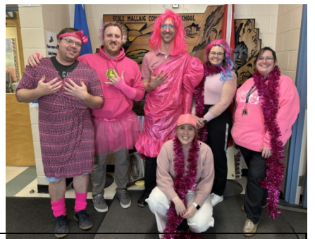
Do a kindness challenge and pick an article to dress a staff member was a great success