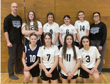
Played some great games and placed 4th at SPAA